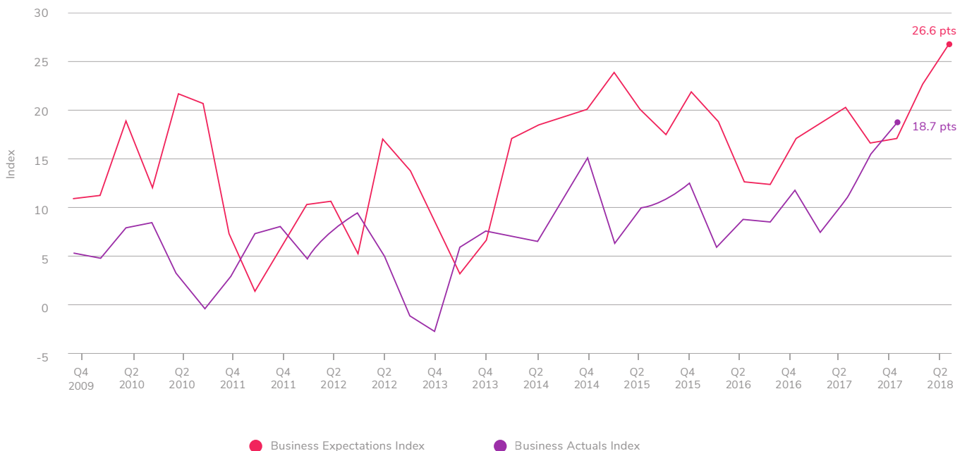
Business Expectations Index - Q1 2018