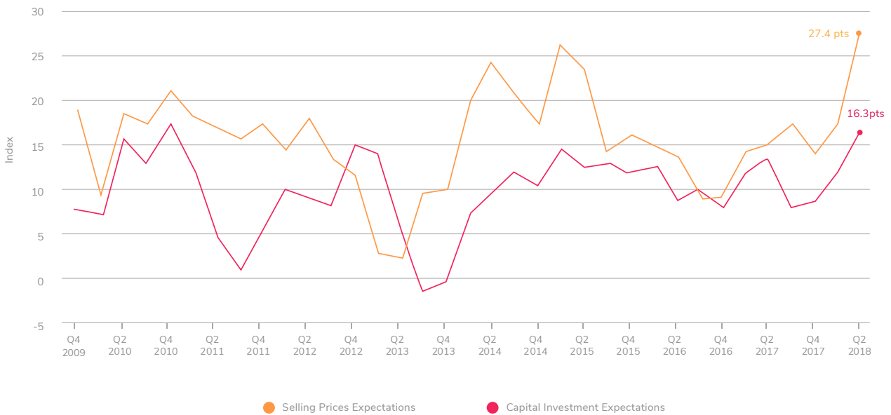
Selling Prices and Capital Investments - Q2 2018

“ After several years of weakness, capital investment edged higher during the first half of 2017. Expected capital investment has risen further in the first half of 2018, reaching its highest level since December 2010. Based on these results, capital expenditure will provide a solid foundation for the economy into 2018. The Selling Prices index rose to its highest level since 2009, well above the 10 year average of 21.9 points. Low inflation has been a critical factor in allowing the RBA to leave interest rates at 1.5 percent. Should the surge in expected selling prices feed into a lift in actual inflation by the middle of 2018, the RBA will be pleased to have inflation back within the 2 to 3 per cent target band. ”